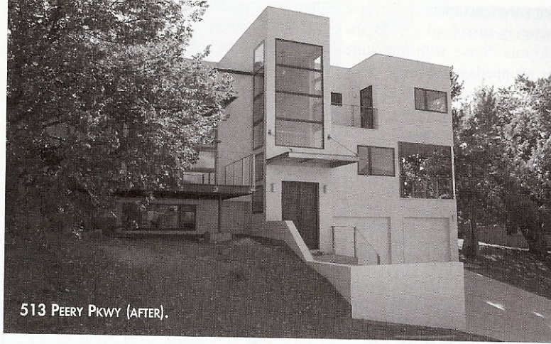
513 PEERY PKWY (AFTER).